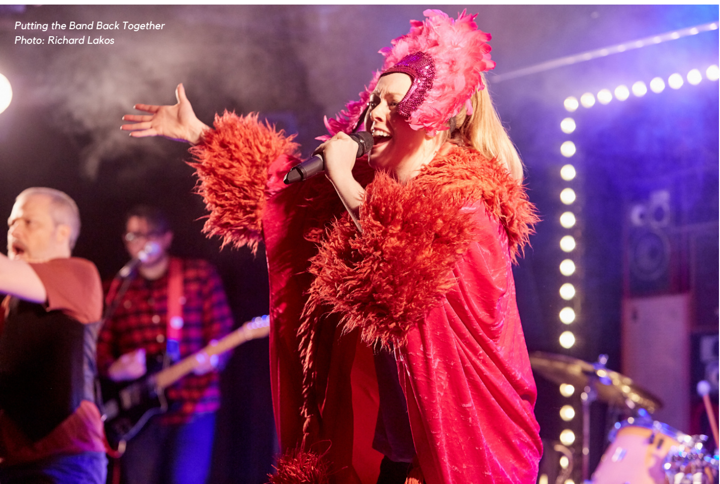
Putting the Band Back Together