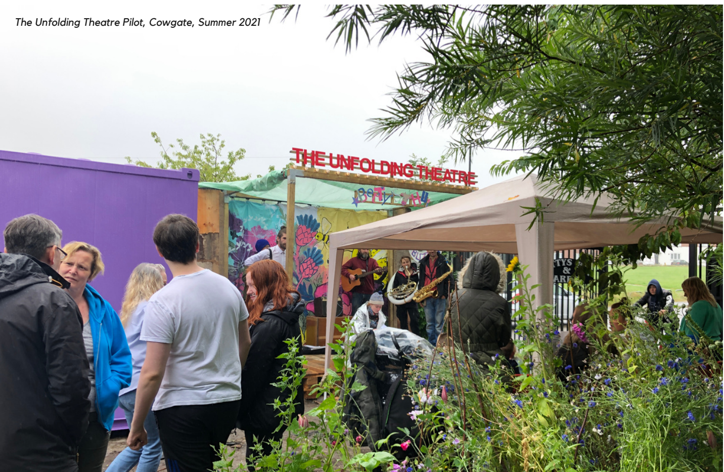
The Unfolding Theatre Pilot, Cowgate, Summer 2021

Read our Business Plan summary at www.unfoldingtheatre.co.uk/about.